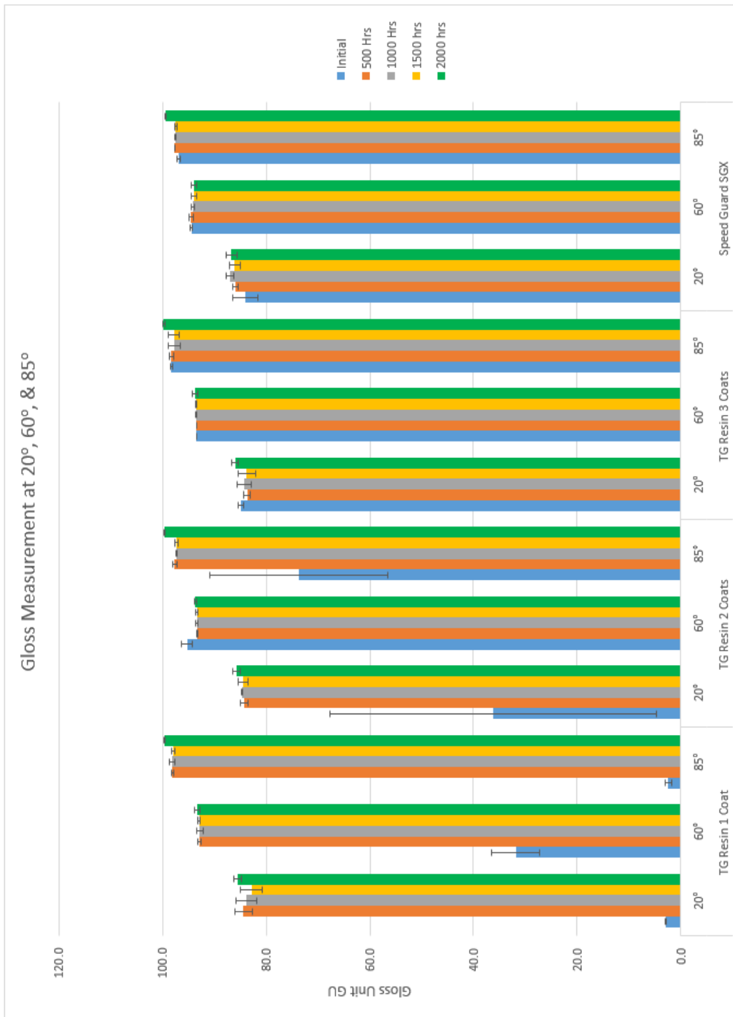
Figure 2 Gloss Unit Comparison of Data at 20°, 60°, and 85° after Xenon Test